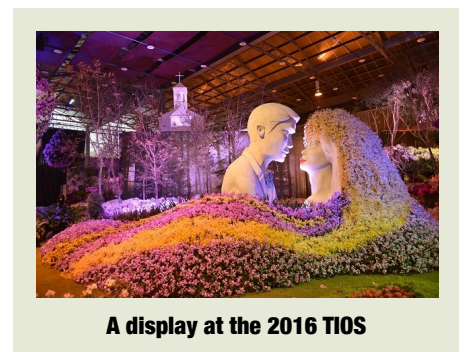
A display at the 2016 TIOS