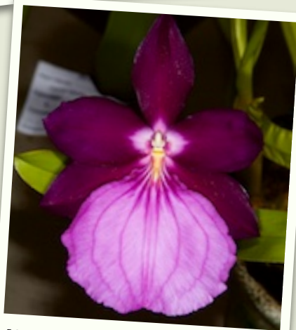
Miltonia spectabilis var. moreliana